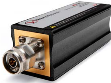
RTP4006 and RTP4106